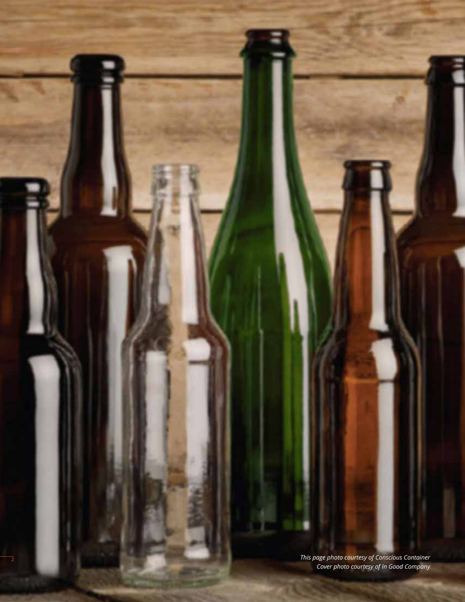
This page photo courtesy of Conscious Container Cover photo courtesy of In Good Company