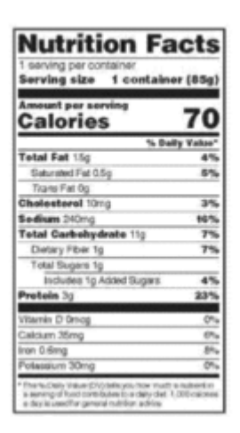
Children 1-3 Years